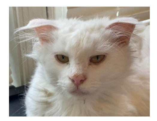
Figure 2. Folded ear tips were reported as an adverse effect of unlicensed molnupiravir therapy in Cat #21.

Cat #22 was reported to have severe leukopenia. Through veterinary records, cat #22 was found to have moderate panleukopenia with lymphopenia, neutropenia, and normal hemogram and thrombogram on 4 out of 5 sequential complete blood counts, which were confirmed through veterinary records of sequential complete blood counts. The first reported white blood cell count was 10,700 cells per microliter (reference range 3500–16,000 cells per microliter). The next four complete blood counts showed white blood cell counts ranging from 1200 to 1900 cells per microliter. The first neutrophil count was 8560 cells per microliter (reference range 2500–8500 cells per microliter). The next four neutrophil counts ranged from 696 to 1292 cells per microliter. The first lymphocyte count was 1177 cells per microliter (reference range 1200–8000 cells per microliter). The next four lymphocyte counts ranged from 330 to 532 cells per microliter.