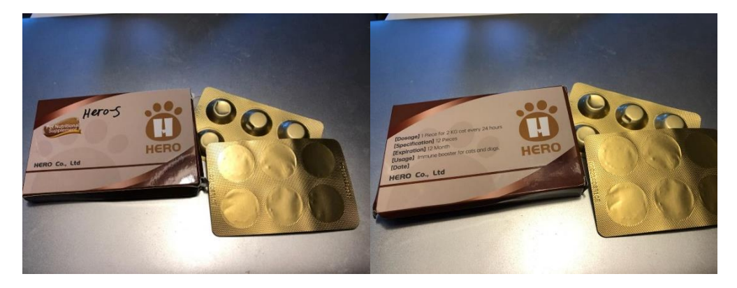
Figure 3. Images of packaging of Hero brand unlicensed molnupiravir product.

There is concern about the contents of the unlicensed brands of molnupiravir, as these brands are not currently regulated and are frequently not labeled with their actual contents. The Hero brand (same manufacturer as HERO Plus 2801) shown in Figure 3 was analyzed by our group in December 2021 through Toxicology Associates Inc. (Columbus, OH). It was found to contain 97.3% molnupiravir, with no detection of other contaminants. The Aura 2801 product used by most of the participants in this study was analyzed in September 2022 by the same laboratory. It was found to contain 96.8% pure molnupiravir. A more controlled assessment of the true content and purity of the unlicensed formulations of both GS-441524 and molnupiravir is of great interest to the veterinary community and an active area of investigation for our group.